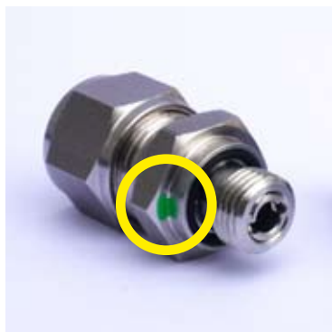
Fitting with filter (marked with two green dots)