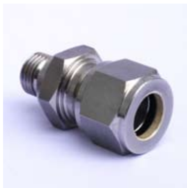
Fitting without filter

The fittings are delivered in pairs and must be mounted as follows: with filter at the inlet and without filter at the outlet.